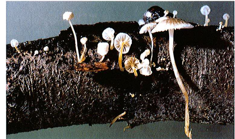
Pl. 98. Marasmiellus omphaliformis

fimbriate edge. Stipe 4–14 × 0.7–1.3 mm, cylindrical, sometimes broadened towards apex and/or base, creamy-white at apex, pale brown or yellow-brown below towards dark grey-brown base, finely pruinose-hairy, with remarkable, white-ochraceous to reddish brown tomentose-strigose basal tomentum. Context pallid. Smell and taste indistinct.